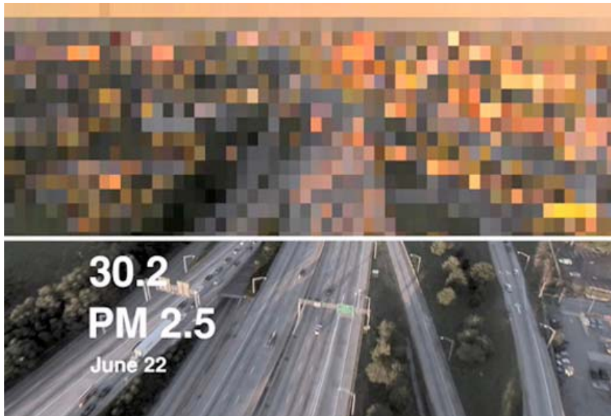
Figure 3 Carl DiSalvo and Jonathan Lukens, Smog is Democratic