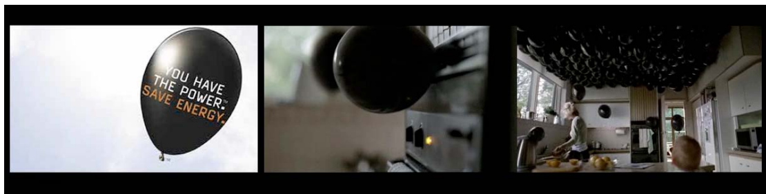
Figure 2 What is a black balloon?

What is a Black Balloon? is a series of motion graphic advertisement as a part of statewide campaign in Victoria, Australia (Figure 2). It is a simple way to measure and visually represent greenhouse gas emissions from domestic environment such as kitchen, laundry room, dining room, as well as an entire house. The video attempts to deliver an obvious but possibly unrecognized fact: using less energy will mean less greenhouse gas emissions, and will help to reduce the impact of climate change. In the video clip appear black balloons, each of which represents a unit of measurement, 50g of greenhouse gas. A balloon pops out from a single appliance at first, followed by many others that finally fill the upper space of a house. However people except a baby in the advertisement do not recognize the existence of the balloons, the metaphor of potential threat to environment. Viewers are not expected to count the specific number of balloons and calculate the total emission of greenhouse gas. Rather they may have visceral responses such as panicking or emotionally paralyzing through the abstract and aesthetized statistics.